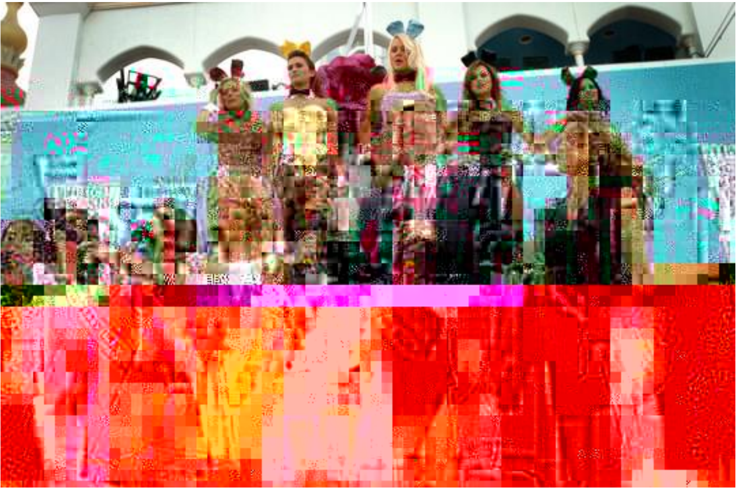
Trump (center) stands on a giant birthday cake, flanked by Anderson, his wife, Pageant winners and Playboy Bunnies in front of the Taj on the boardwalk. Sat. 6/11/05 Donald Trump hosts Pamela Anderson, National and International Pageant winners, and Playboy centerfolds and bunnies at the Atlantic City Taj Mahal for his Quarter Million Dollar Birthday Giveaway celebration.