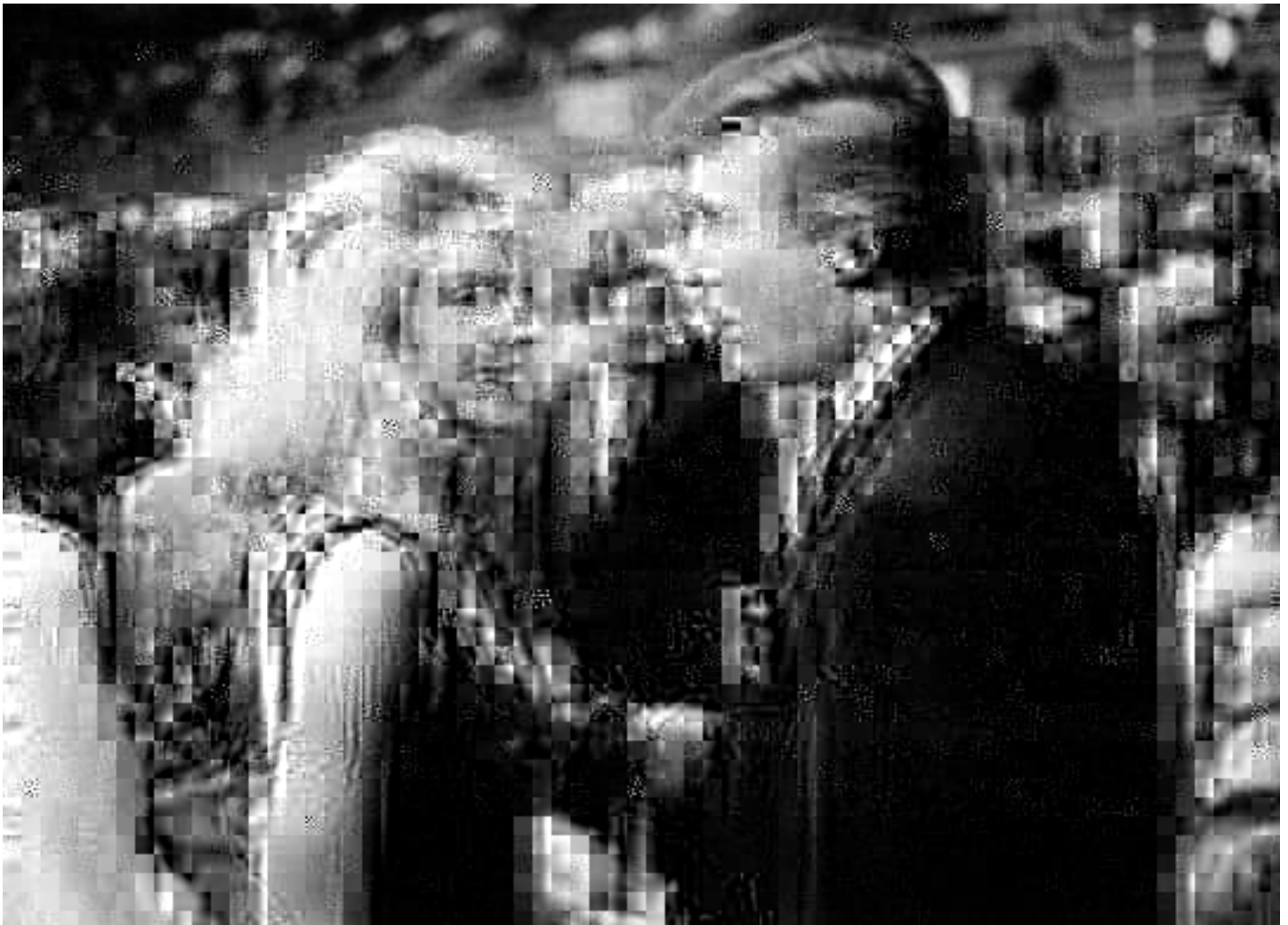
Marla Maples and Donald Trump attend the fight between Evander Holyfield and George Foreman, at Boardwalk Hall, in Atlantic City, April 19, 1991.