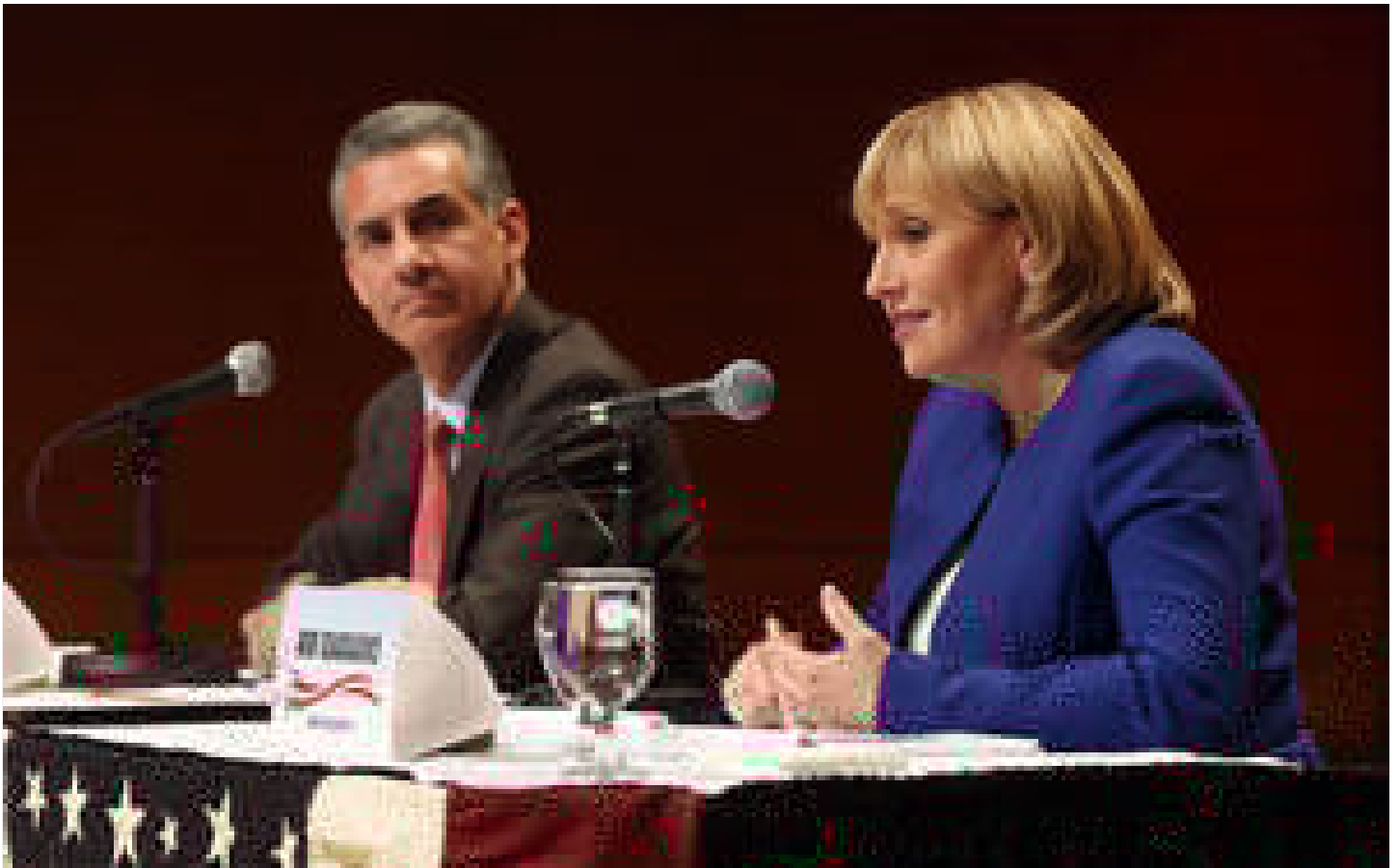
Republican candidates for governor debate Atlantic City issues