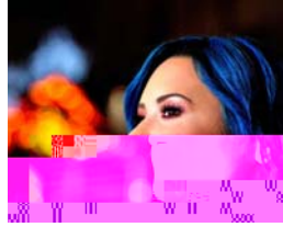
Sideshow: Demi Lovato, adult artist!