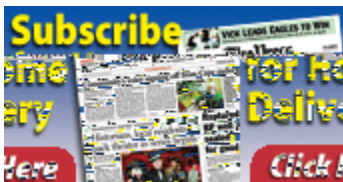
Promo - 170x90 Subscribe Home Delivery PAC Button

© Copyright 2012, pressofAtlanticCity.com, Pleasantville, NJ. Powered by BLOX Content Management System from TownNews.com. [ Terms of Use | Privacy Policy ]