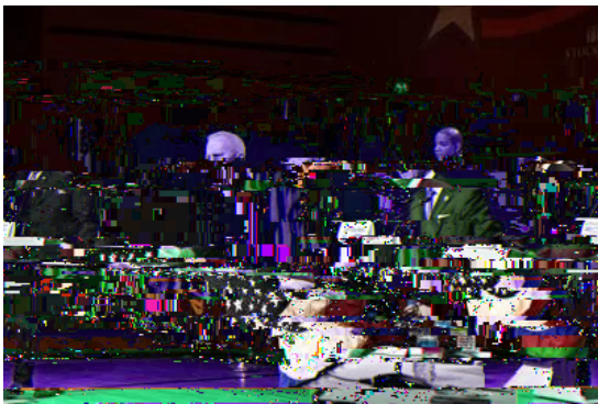
Stark differences between major party 2nd Congressional District candidates